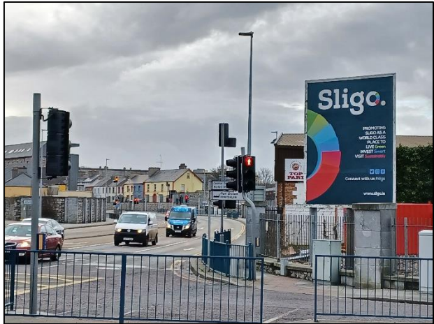
Sligo. brand sign on Hughes Bridge