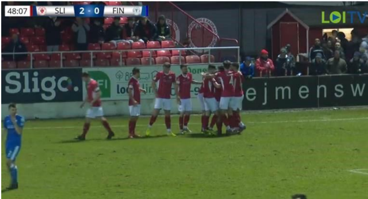
Sligo Rovers v. Finn Harps 14 th March 2022 with Sligo. brand pitch side sign in background