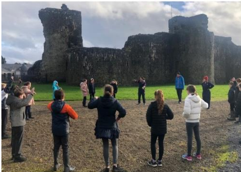
Science Week, Ballymote – project in collaboration with IT Sligo & Abbvie

Due to the ongoing impact of Covid 19, most verifications were carried out virtually – projects visited include Birdwatching talks via zoom, QQI Level 4 Online Community Mentoring and Advocacy Training, Rethinking Community Communications, Basic Book-keeping, Intro to Menopause, Start Your Own Business and IT Sligo - Science Week Activities.