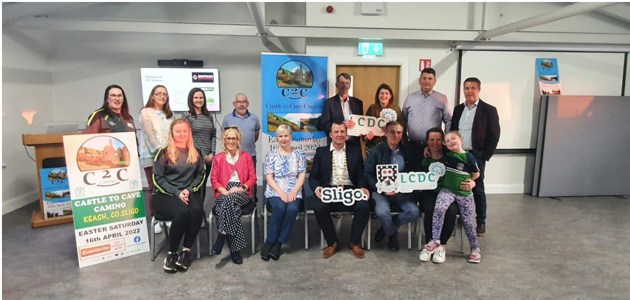
Members of Sligo County Council and Sligo LCDC with the Project Promoter (Eastern Harps GAA) at the Launch of the Castle to Cave Camino on 29.3.22