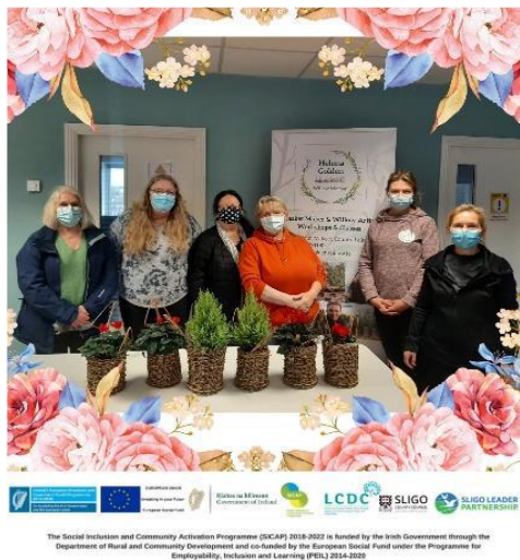
Willow Weaving Workshop at Enniscrone FRC