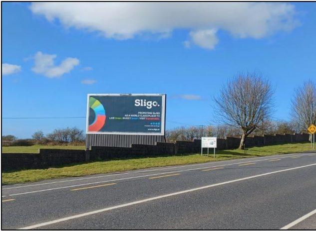
Sligo. brand billboard Pearse Rd route into Sligo Town

(approximately 25,000 vehicles per day use Hughes Bridge). This has aided brand recognition among the local public as well as the brand stakeholders.