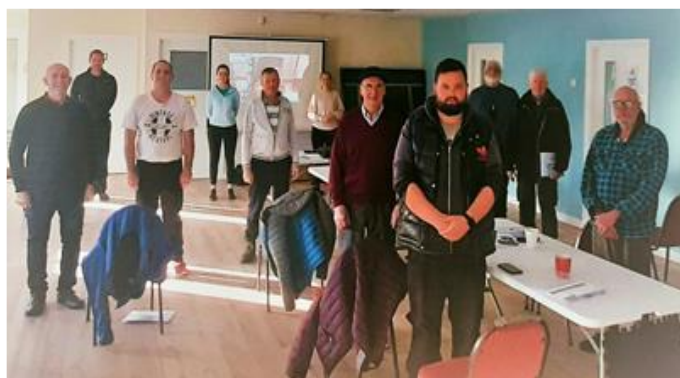
Ways to Wellness Event with Enniscrone Men's Shed