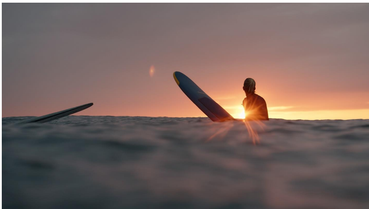
Screenshot from "Sligo – so much more than a beautiful place" video