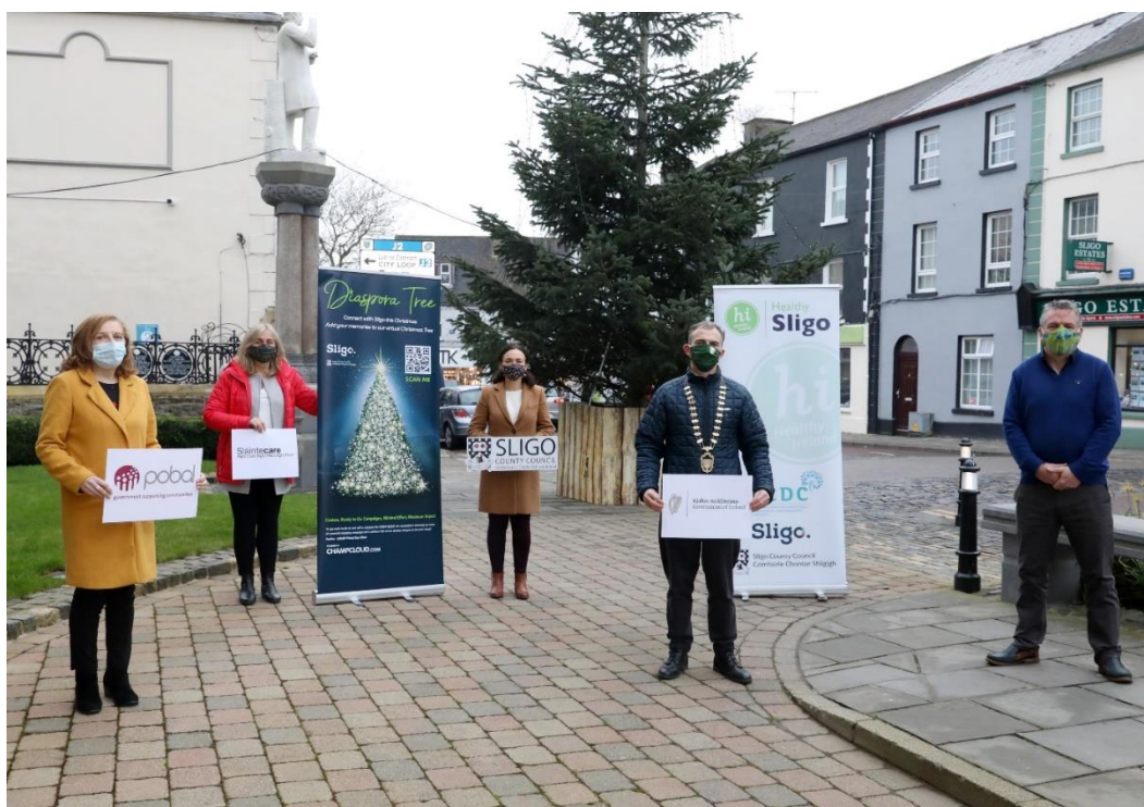
Launch of the virtual Christmas