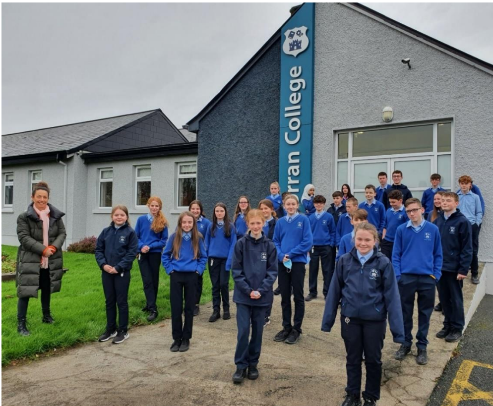
Young peoples school nutrition Project - Students at Corran College, Ballymote