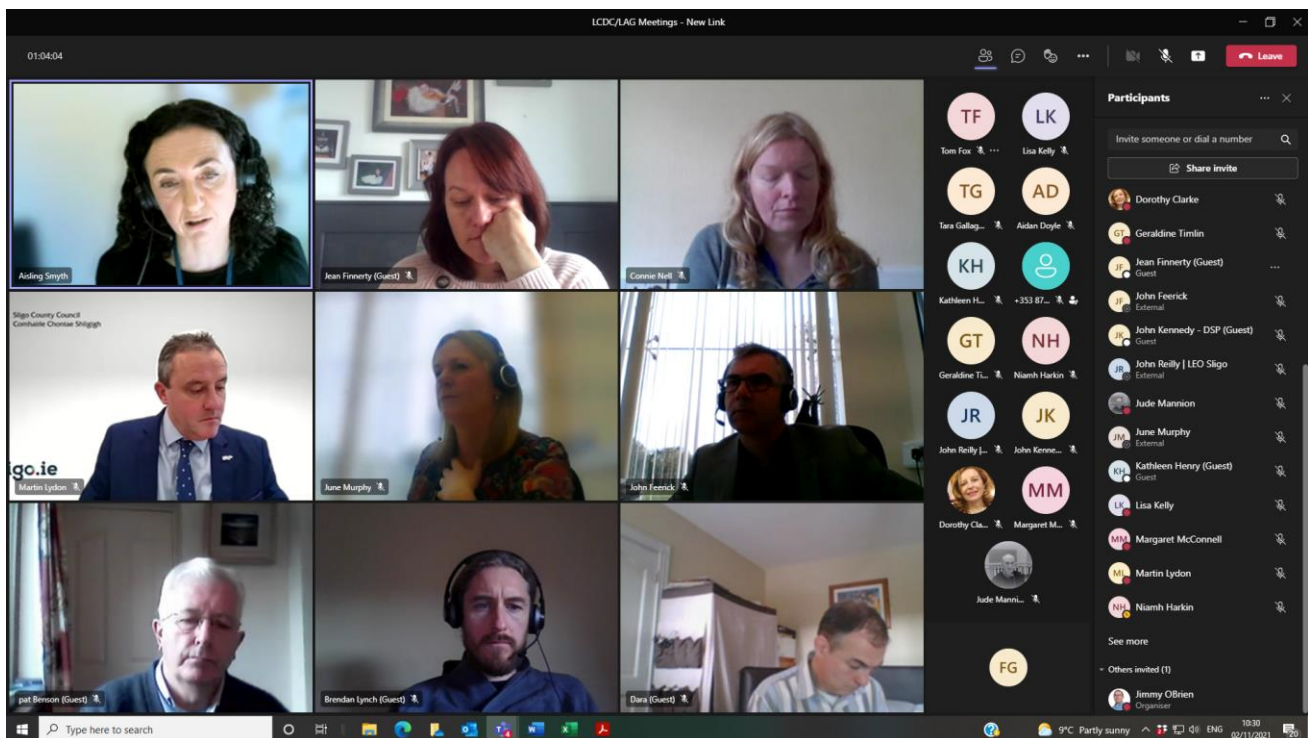
LCDC/LAG - Virtual Meeting in session 2 nd November 2021