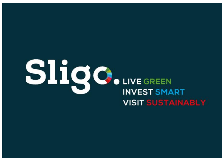
Sligo. brand logo with updated taglines to reflect Sligo 2030

Sligo: Live Invest Visit was developed as a unique umbrella brand that helps deliver a positive message for Sligo. This gives organisations, community groups and the people of Sligo a central brand under which all of the positive Sligo stories can be celebrated and promoted. Under the 3 pillars of live/invest/visit the new brand presents an opportunity for Sligo to promote a positive image which will entice visitors and investors to the area to enjoy the Sligo landscape, culture, educational and innovative opportunities, with excellent choice and quality of life.