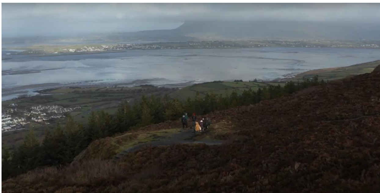
Screenshot from Diaspora video launched for St Patricks Day 2021 which attracted 170,000 views across all channels