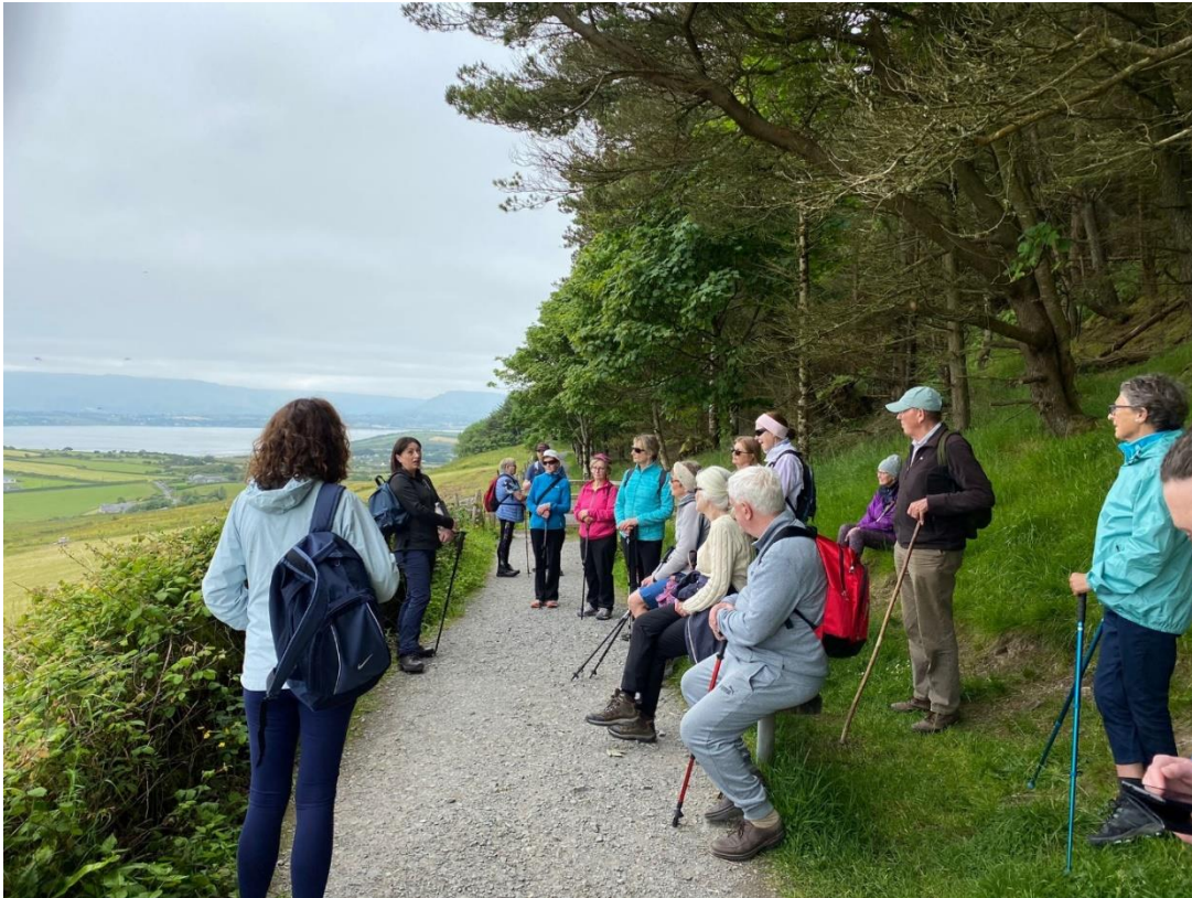
Walks during Lockdown on Knocknarea