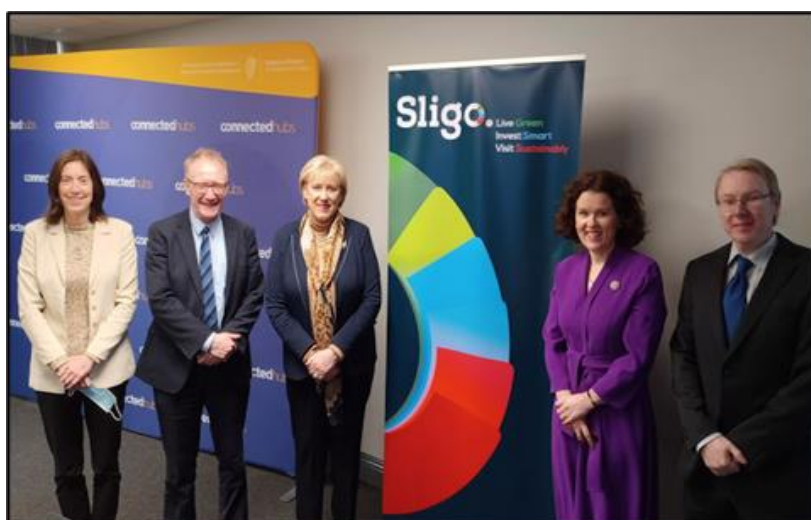
Minister Heather Humphreys T.D. at An Chroi Digital Hub Launch

On 4th March 2022 Minister Heather Humphreys opened the new upgraded facilities at the An Chroi Digital Hub in Tubbercurry that included a smart suite and virtual shop front that were part of the AEC Smart Village and Community Pilot. The aim of this project, funded by the Department of Rural and Community Development was to develop a number of pilot villages that will provide smart solutions to key regional challenges identified within the regional development policy framework.